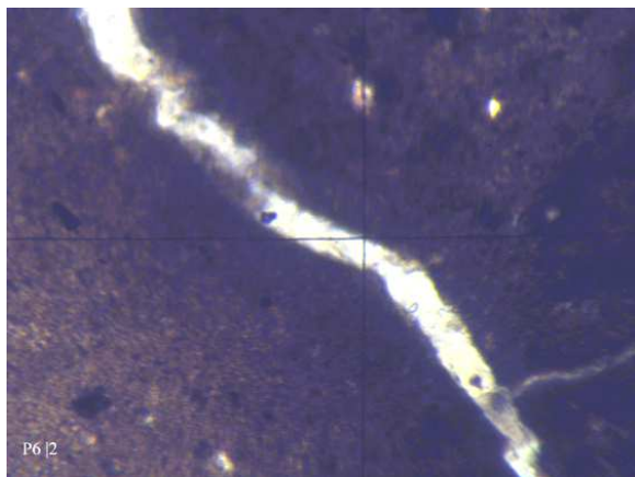
Fig. 2. Plane voids and argillasepic plasmic Fabric soil profile No2(35.9x)