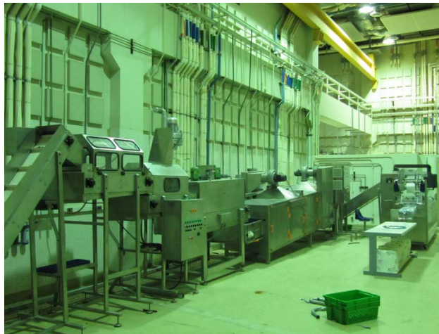
Fig (1): Pilot scale packaging line

The date fruits were initially cleaned using air stream on vibrated belt then sorting was manually done according to its condition and size to produce homogenous quality and size where the dates is sorted. The rotten ones were separated and the rest was further passed on via conveyor belts to the next washing step. In washing section the dates passes through washing drums with water showering nozzles. The water was then automatically drained through the small pores in the conveyer belt. Then the fruits conveyed to softening section when the fruits exposed to hot air stream for a period of time. Three different temperatures of 50, 60, and 70°C were utilized during this research work using a control panel of temperature. Five different exposure times of 15, 30, 60, 120 and 180 seconds were employed in this study. The exposure times was controlled by changing the speed of belt conveyer.