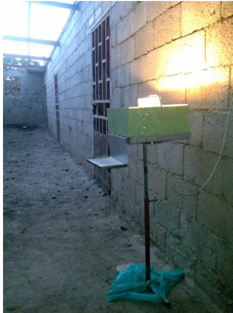
Figure (2) : A photograph of the trap.