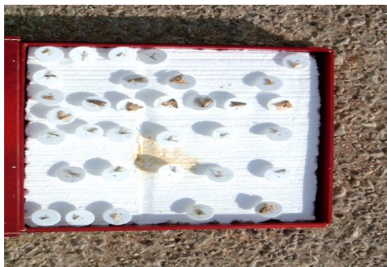
Figure (3): Some of the samples taken by the hook manufacturer.

The population density means the number of personnel in the unit area or unit volume and shows that the amount of the abundance of the total. The changes in population density of the insect and that during the months of the experiment. The phenomena observed in the area of climate research with the aim of linking them to changes in the intensity of the numbers of insects were observed for the insect population density in the study area by using the optical trap attracting manufacturer. Where, emptying the contents of the trap in the form of cans, plastic Fig (3) The samples were taken to laboratories, Faculty of Agriculture, where counting and recording the number of insects. Then the order and classification of insects and other outstanding. Different method to estimate the population density of the insect, according to a number of factors, including that of the same, including Balhacrp regarding the areas in which they occur.